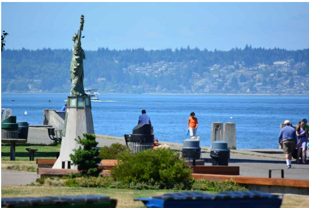
Alki Beach Park in West Seattle