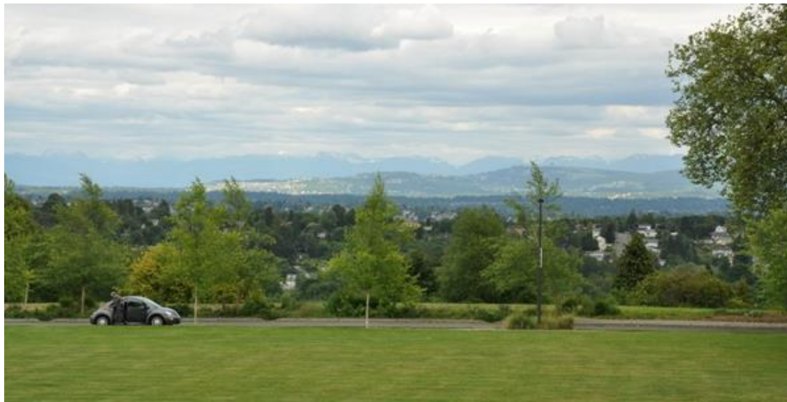
West Seattle Parks and Greenway Spaces taken by Walt Hundley Playfield