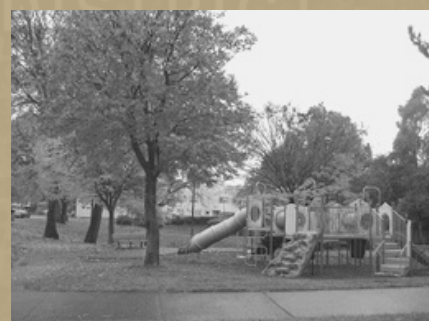
Years Of Seattle Parks

After the observation of the neighborhood and noticing the amount of resources they lacked. We were able to find multiple parks but limited gyms. These resources can contribute to physical and mental health. The only issue was finding if those resources are being used. Additional resources that could not be found in the neighborhood but nearby was access to counseling or therapy.